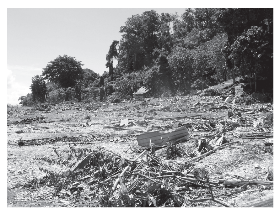
Figure 1. The destroyed site of Tapurai, a village of fifty households, ten days after the disaster.

coming up and that they should escape to the hills behind the village. She tightly grasped her children's hands and ran.