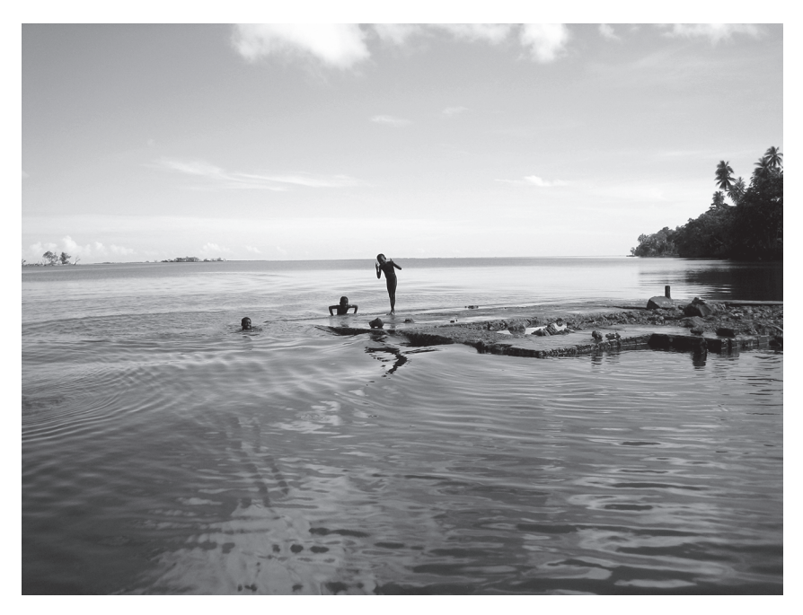
Figure 3. Children playing on Simbo's main wharf in 2011. The earthquake caused Simbo to sink more than half a meter, so the wharf became partially submerged during high tides. It was rebuilt to be above sea level by the national government several years later.

the surrounding islands as well as triggering thousands of landslides.<sup>2</sup> On Simbo large boulders were dislodged and rolled down the north flank of Mt. Patu Kio, the 300-meter-high volcanic cone near the center of the island, causing a landslide.