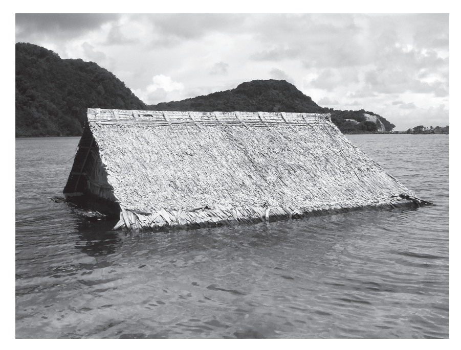
Figure 2. An intact thatch house that was lifted by the tsunami and floated out into Simbo's lagoon, where it came to rest. The photo was taken ten days after the tsunami, by Hermann Fritz, a researcher from Georgia Tech University who visited the island to record the physical effects of the tsunami.

to rest with only the leaf roof visible above the water's surface (see figure 2). The sea floor underneath the house was a jumble of rubble that was a vibrant coral reef before the tsunami.